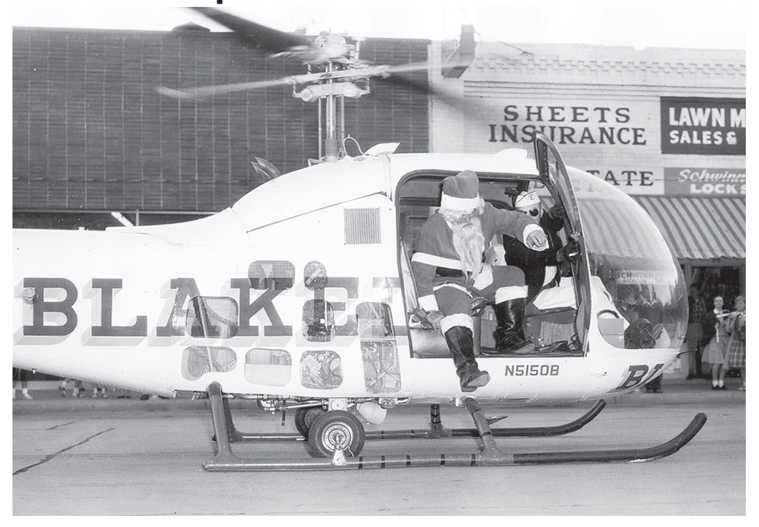
Santa lands near Murphy Park c. late 60s, early 70s.