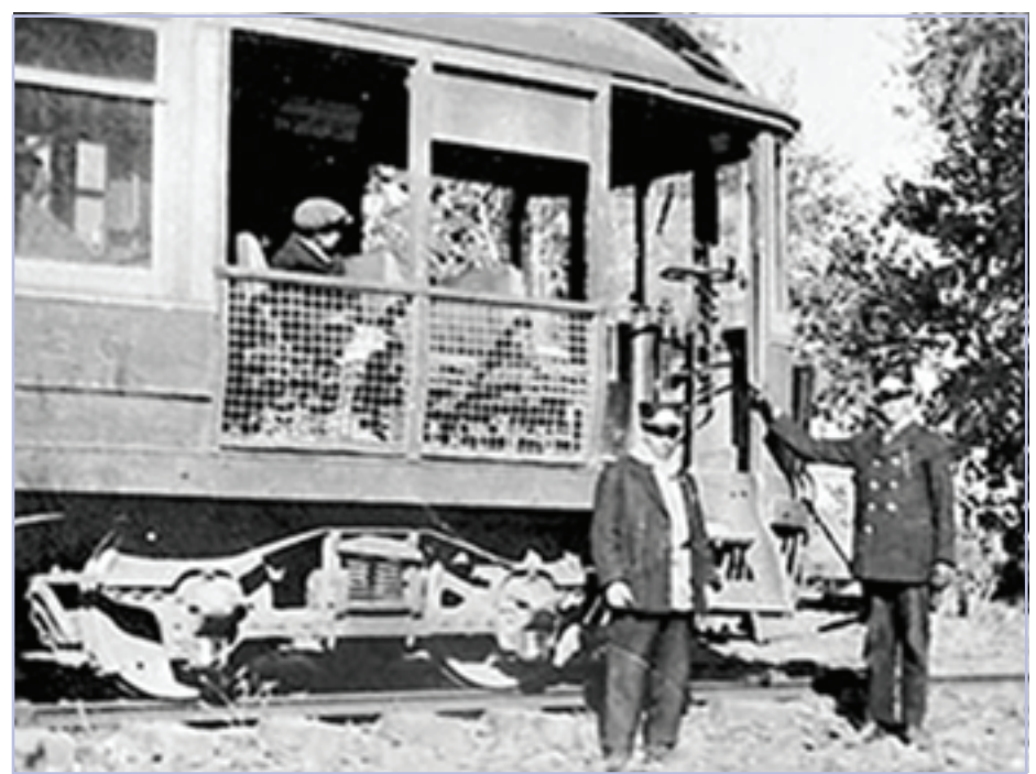
All aboard the Phoenix to Glendale trolley.