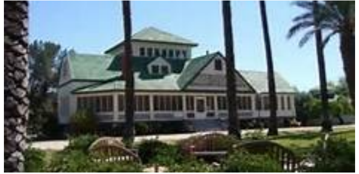
Manistee Ranch in Need of TLC

The year 2014 seems to have gone by quickly. The November Ole Timers Picnic was very well attended and all had a good time with great food.